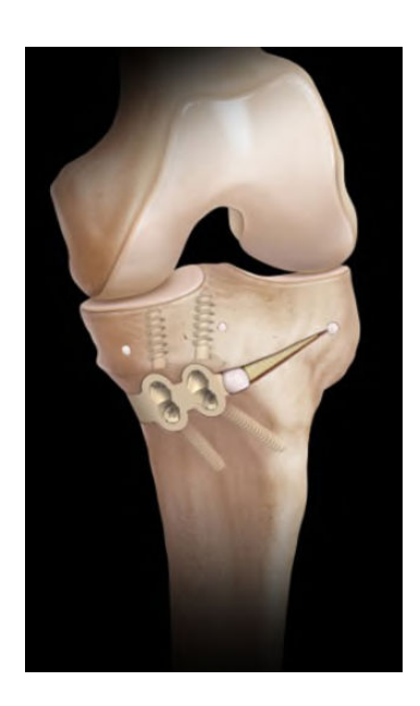
Figure 1. Schematic demonstrating the all-PEEK high tibial osteotomy system.

injuries, delayed/nonunion, and painful hardware.<sup>7</sup> With the exception of external fixation methods, maintenance of the HTO correction is traditionally completed with a metal plate. These plates have been shown to have drawbacks however, especially hardware irritation. A study by Niemeyer et al<sup>6</sup> reported a 41% rate of hardware irritation, and the rates of hardware removal have been reported as high as 60% to 99%.<sup>1,6</sup> Additional disadvantages of a metal plate include the obscuration of detail on magnetic resonance imaging and an increase in the complexity of revision surgery, including the need for removal of hardware for future joint arthroplasty.