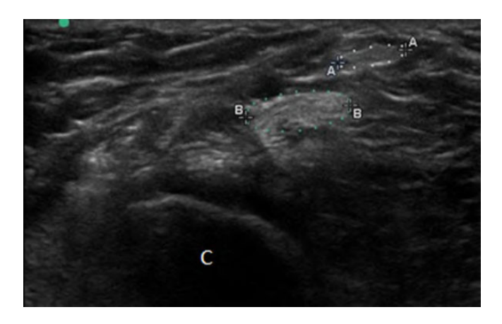
Figure 1. Ultrasonography of the hamstring tendons as they pass around the medial femoral condyle: gracilis tendon ( A ), semitendinosus tendon ( B ), and medial femoral condyle ( C ).

The semitendinosus and gracilis tendons, as they pass around the medial femoral condyle, were assessed by ultrasonography (Fujifilm SonoSite) by 1 physical therapist trained and experienced in ultrasonography. This US was completed within 14 days of surgery. With the patient positioned prone, a bolster was placed under the knee to maintain 30° of flexion and to keep the knee relaxed. Doubledcombined hamstring size was independently calculated with a freehand selection method on a nonmagnified US image (ImageJ software; National Institutes of Health) by 2 blinded orthopaedic surgeons. Each surgeon completed 2 sessions of measurements separated by at least 3 days. During each session, 3 measurements were completed. The overall mean was taken and used for analysis. Figure 1 provides an example of hamstring ultrasonography and measurement. The hyperechoic region of each tendon was outlined with ImageJ software. Using the traced area, the software calculates a diameter multiple times and takes the mean because the area is not a perfect circle.