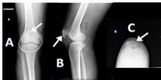
Figure 1: (A) AP, (B) lateral, and (C) sunrise views of the knee. The patella (white arrows) exhibits erosive osteolytic changes in all views, denoted by increased lucency compared to the surrounding bones. In Image A, the patella is outlined in white, and erosive (radiolucent) changes are notable at the superior pole (white arrow).