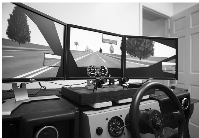
Figure 1. Picture of the driving simulator set-up.

The simulator session entailed a driving session of approximately 10 minutes through a suburban type environment. Figure 2 displays a screenshot of the driving simulator scenario. To test braking time specifically, a stop sign was flashed across the screen randomly a total of 3 times throughout the session, signifying to the participant to fully press the brake pedal as quickly as possible. The mean braking reaction times (BRTs) were calculated from these 3 occurrences. Before the first simulator session, the participant practiced this situation under supervision by a laboratory member to confirm understanding of instructions. Specific variables measured during these simulator sessions included initial reaction time (IRT) (time between stimulus and initiation of release of accelerator), throttle release time (TRT) (time from initiation to full release of foot from accelerator), foot movement time (FMT) (time between release