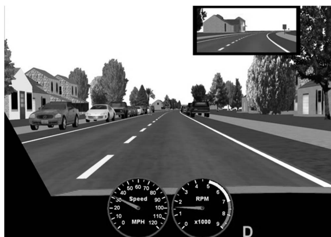
Figure 2. Screenshot of the driving simulator scenario.

of accelerator and initial contact with brake), and brake travel time (BTT) (time to apply 200 N force 9 from initial brake press). The BRT was calculated as the sum of IRT + TRT + FMT, whereas the total braking time (TBT) was calculated as the sum of BRT + BTT. 7